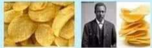
potato chips George Crum