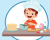
bake a cake