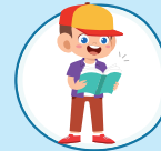
read a book