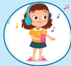
listen to music