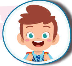
cousin بنت / ابن (العمر / العمة / الخال / الخالة)