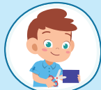
make a model