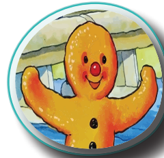
The Gingerbread Man