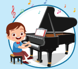
play the piano