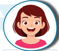
aunt عمة - خالة