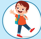
walk in the park