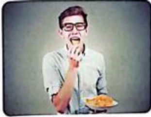
Photo no. (1)

7. Look at the opposite figure, then complete the following sentence:-