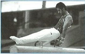
to ... do ... gymnastics.