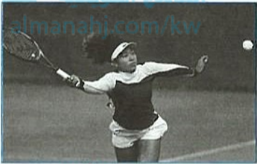
to ... play ... tennis.