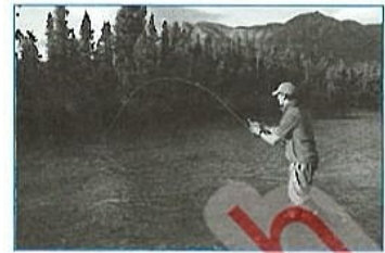
to ... go ... fishing.