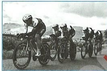
to ... go ... cycling.